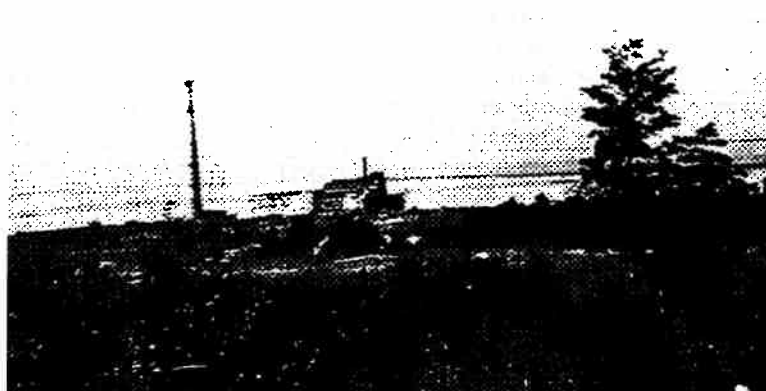
First Western Picture of Obninsk Plant

In 1954 the Russians publicized the initial operation of the first atomic power station in the world at Obninsk (the variant name used for the town served by Obnino station).