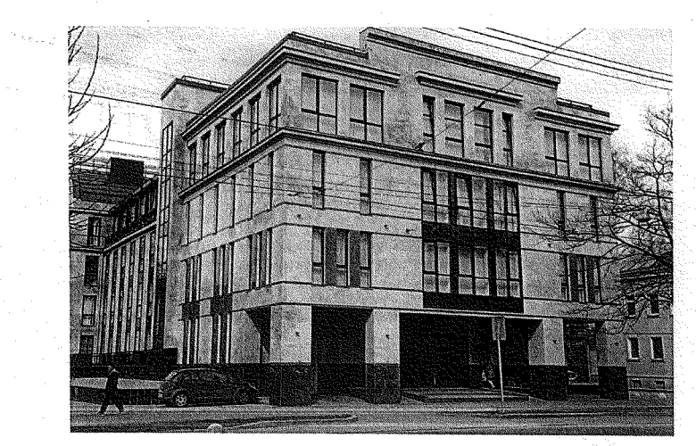
The Internet Research Agency, in St. Petersburg, Russia, was said to be the hub of the operation.

Applying nearly two years' worth of political research, the Russians used all of these tactics to target voters in swing states, notably Florida, according to the indictment.