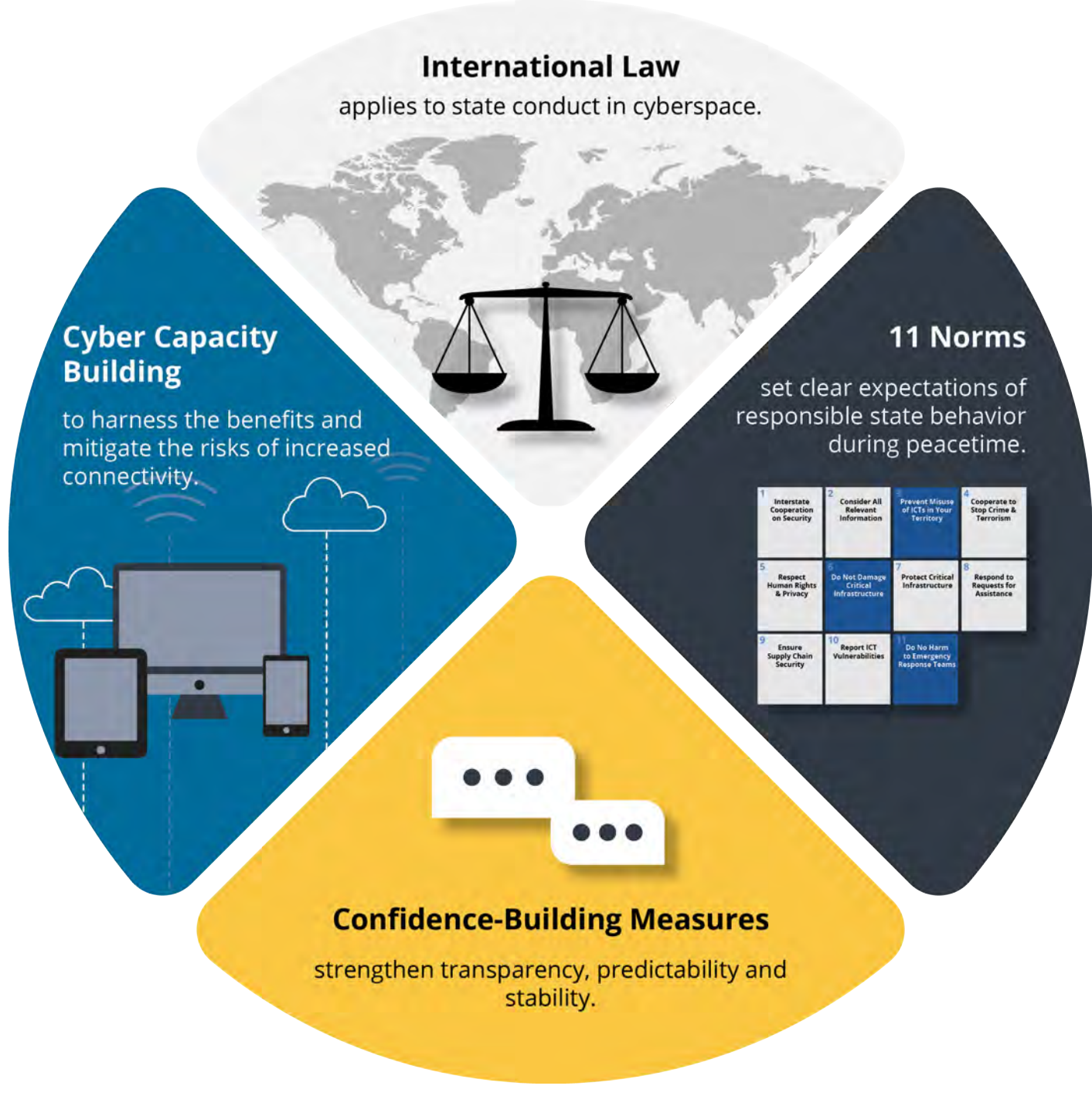
Figure 4. Four components that make up the UN framework of responsible state behavior in cyberspace. (Australian Strategic Policy Institute/United Nations General Assembly illustration.)