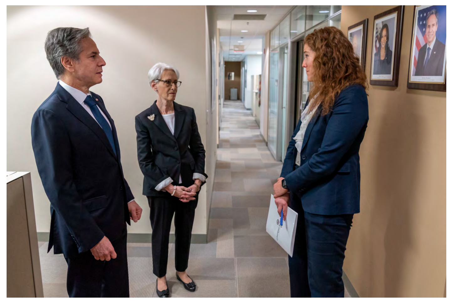
Figure 2. Secretary Blinken and Deputy Secretary Sherman Visit the new Cyberspace and Digital Policy Bureau at the U.S. Department of State in Washington, D.C., on April 4, 2022.