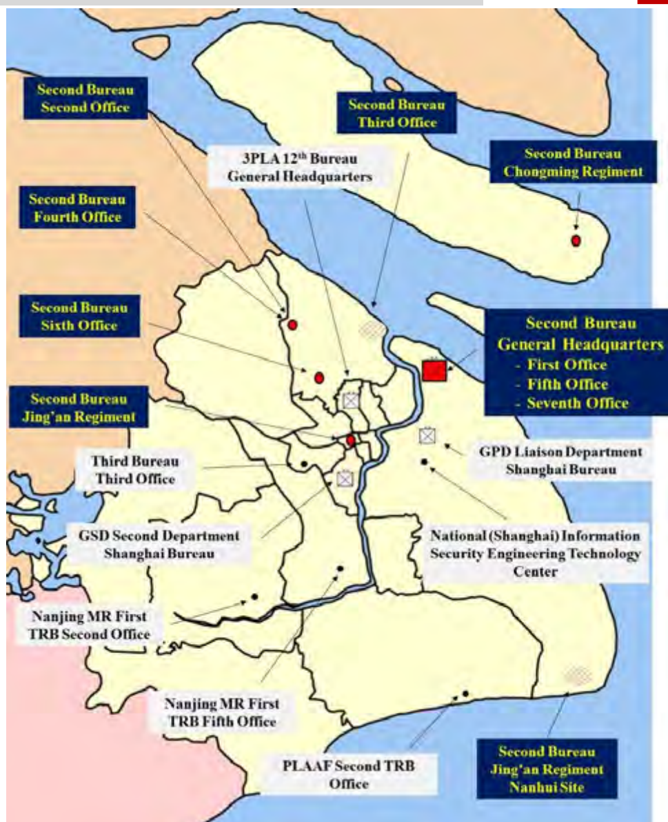
Figure 7: Shanghai's Military Intelligence Community