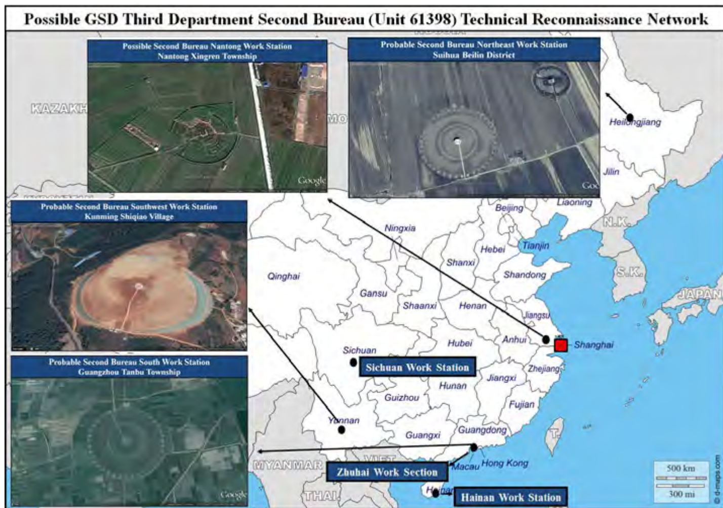
Figure 5: Unit 61398 Technical Reconnaissance Network