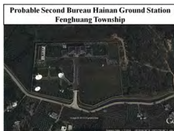
Figure 6: Google Earth Satellite Image of Probable Second Bureau Hainan Ground Station