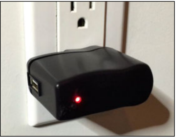
The KeySweeper device in use.