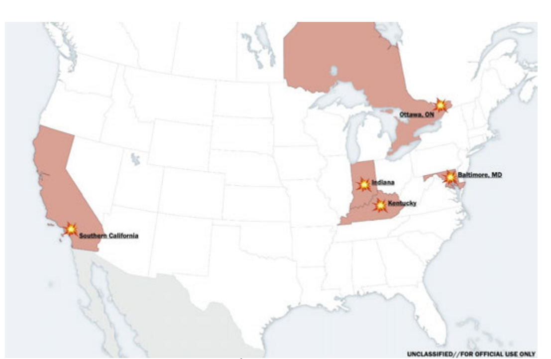
(U) Figure 1: Map depicting targeted hospitals 6

(U) Ottawa, Canada: In March 2016, an Ottawa hospital weathered a ransomware attack after 9.800 of its computers were affected by an attempt to lock the files and demand a ransom.9 The hospital reported that it was able to isolate the computers, wipe the drives, and restore its ability to operate from backup files.10