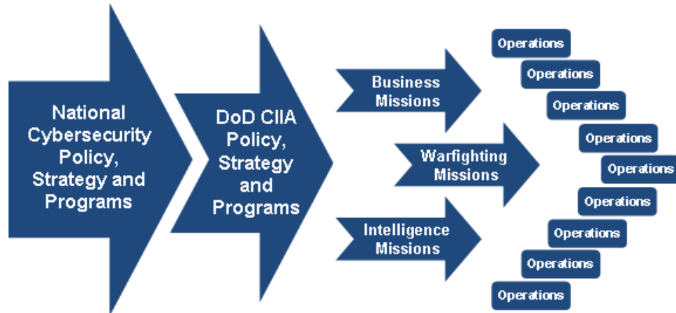
Figure 2. DoD CIIA Strategy Implements National Policy and Strategy and Supports all DoD Missions and Operations

Its contents should be referenced and incorporated into DoD Component and CPM) plans that impact CIIA capabilities. It updates and replaces the DoD 2004 Information Assurance Strategic Plan and all interim updates, and reinforces the critical contribution of the CIIA community in making DoD networks, information and information technologies secure, available, and sound for purpose. It implements national cybersecurity policy and strategy, helps shape National and global cybersecurity markets and technology pipelines, and it supports the full IM/IT life cycle across all defense business, intelligence and warfighting missions and operations, as illustrated in Figure 2.