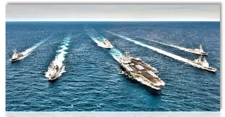
The Enterprise Carrier Strike Group transits the Atlantic Ocean, supporting maritime security operations and theater security cooperation efforts in the U.S. 6th Fleet area of responsibility.

As the Department rebalances toward greater emphasis on full-spectrum operations, maintaining superior power projection capabilities will continue to be central to the credibility of our Nation's overall security strategy.