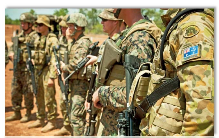
U.S. Marines with the 2nd Fleet Anti-Terrorism Security Team and Australian soldiers with the 5th Battalion, Royal Australian Regiment conduct training at a live-fire range at Robertson Barracks in Darwin, Australia.

As many Asia-Pacific countries seek to achieve greater prosperity, establish regional norms, and strive for a stable military balance, North