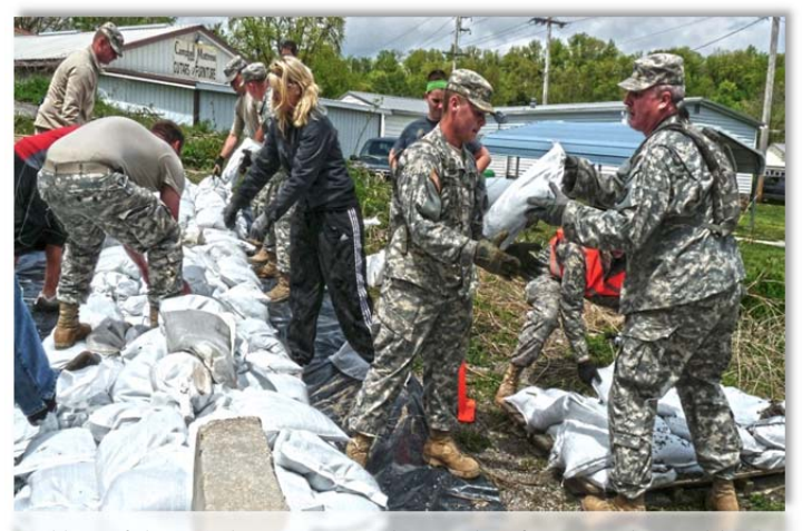
Soldiers of the 1140th Engineer Battalion, civilian first responders, and local residents work quickly to build a three-foot sandbag wall to prevent possible flood waters from closing a Missouri highway intersection.

The most fundamental duty of the Department of Defense is to protect the security of U.S. citizens. The homeland is no longer a sanctuary for U.S. forces, and we must anticipate the increased likelihood of an attack on U.S. soil. Against a varied, multifaceted, and growing set of threats, we continue to take an active, layered approach to protecting the homeland. We will maintain steady-state force readiness, resilient infrastructure to support mission assurance, and a