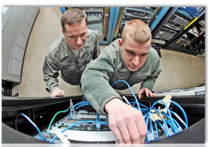
U.S. Air Force technicians assigned to the 354th Communications Squadron support the new Air Force Network system enhancing cyber capabilities, by providing network oversight to all U.S. Air Force installations.

Deterring and defeating cyber threats requires a strong, multi-stakeholder coalition that enables the lawful application of the authorities, responsibilities, and capabilities resident across the U.S. Government, industry, and international allies and partners. We support the Federal government cybersecurity team and