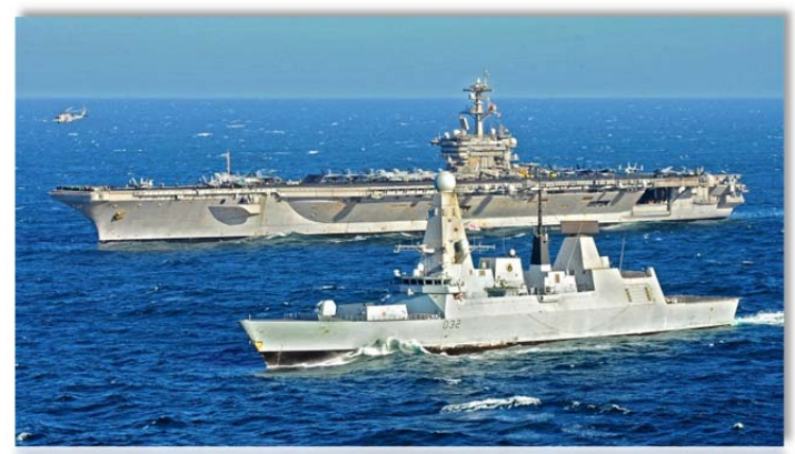
British Royal Navy destroyer HMS Daring operates alongside the U.S. aircraft carrier USS Carl Vinson in the U.S. 5th Fleet area of responsibility.

For example, the United States will work with the United Kingdom and Australia to enhance collaboration between our respective defense planning processes. The United States is working with the United Kingdom to regenerate its aircraft carrier capability in the future, which will enable interoperable use of advanced fighters and allow more flexible options for combined employment of