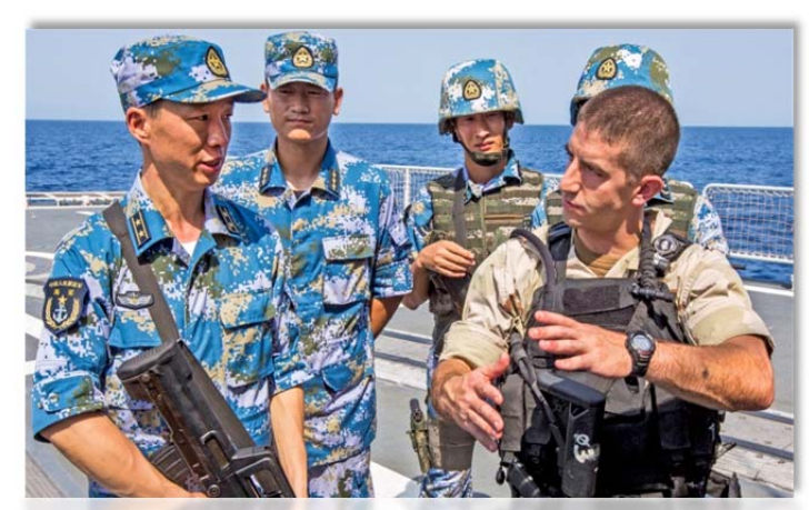
U.S. Navy Officer from USS Mason discusses techniques with Chinese sailors aboard the Chinese destroyer Harbin before a combined small-arms exercise in the Gulf of Aden.

deepening our defense relationships with key partners in the region, such as Singapore, Malaysia, Vietnam, and many others. Through both our alliances and partnerships, we are focused on enhancing our partners' capacity to address growing regional challenges in areas such as missile defense, cyber security, space resilience, maritime security, and disaster relief. With China, the Department of Defense is building a