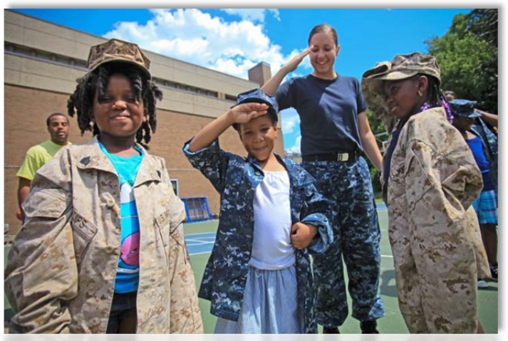
A U.S. Navy Specialist Seaman teaches children to salute at the Yawkey Boys and Girls Club during Boston Navy Week 2012 which commemorated the Bicentennial of the War of 1812. The eight-day event hosted service members from the U.S. Navy, Marine Corps, and Coast Guard as well as coalition ships from around the world.

The past twelve years of combat have profoundly affected the All-Volunteer Force. Soldiers, Sailors, Airmen, and Marines from all components served with have distinction. Even as the entire Joint Force reaches the end of the U.S.-led combat mission in Afghanistan devotes greater