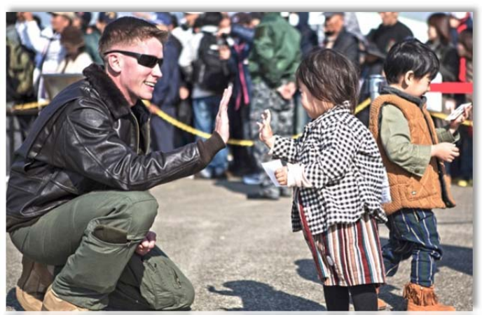
A U.S. Marine greets a child during the annual Japan Air Self-Defense Force Nyutabaru Air Base Air Show in Okinawa, Japan.

Built on a foundation of common interests and shared values, the strength of U.S. alliances and partnerships is unparalleled. People around the world gravitate toward the freedom, equality, rule of law, and democratic governance that American citizens are able to enjoy. From setting