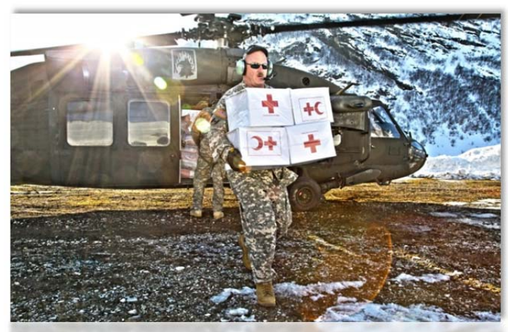
U.S. Army Sgt. 1st Class, assigned to the 12th Combat Aviation Brigade, carries supplies from a UH-60A Black Hawk to deliver to citizens in Montenegro stranded by severe weather. A U.S. task force provided humanitarian assistance after record snowfalls left tens of thousands in the country's mountainous north unable to receive food, fuel, or medical assistance.

The U.S. military forward and rotationally deploys forces - which routinely provide presence and conduct training, exercises, and other forms of military-to-military activities - to build security globally in support of our national security interests. In support of these goals, Department will continue rebalancing how we posture ourselves globally. As we rebalance, we will continue to operate in close