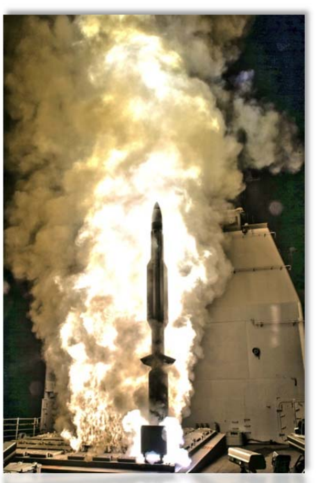
A Standard Missile 3 (SM-3) Block 1B interceptor launches from the guided missile cruiser USS Lake Erie during a Missile Defense Agency and U.S. Navy test. The SM-3 Block 1B intercepted a medium-range ballistic missile target off the coast of Kauai, Hawaii.

Missile Defense. The United States is increasing the number of Ground-Based Interceptors (GBI) from 30 to 44 and building depth into our sensor With the support of the Japanese network. government, we are deploying a second surveillance radar in Japan that will provide early warning and tracking of any missile launched by North Korea. To ensure the homeland is protected against the projected intercontinental ballistic missile threat in the 2020 timeframe, the Department will target investments to increase defensive interceptor reliability and effectiveness, to improve discrimination capabilities, and to establish a more robust sensor network. The Department is also studying the best location for an additional missile defense interceptor site in the United States to shorten the time required to deploy additional interceptors if needed. Allied and partner acquisition of interoperable ballistic