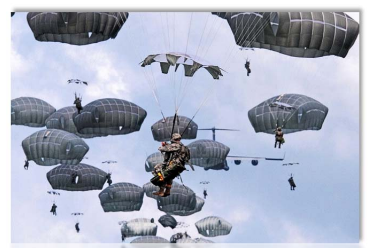
U.S. and Indonesian Army paratroopers descend during a partnered mass-tactical airborne operation as part of exercise Garuda Shield 2013. The paratroopers are assigned to the 82nd Airborne Division's 1st Brigade Combat Team.

to security force assistance to major combat operations, from deterring aggression to having the ability to win decisively if deterrence fails. In a fiscally constrained environment, the future U.S. Army will need to be capable of conducting prompt and sustained land combat as part of large-scale, multi-phase joint and multilateral operations, including post-conflict stability operations that transform battlefield victories into enduring