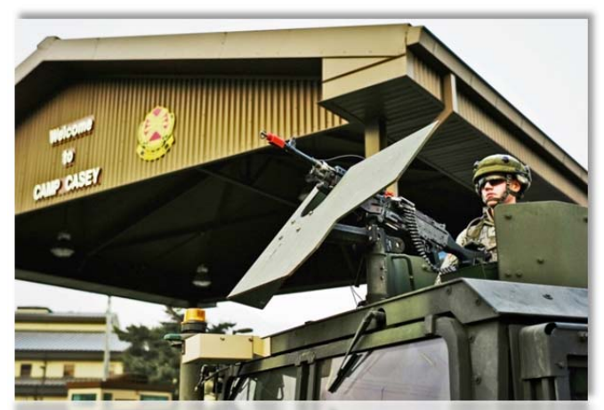
A Soldier assigned to 1st Battalion, 72nd Armor Regiment, 1st Armored Brigade Combat Team, 2nd Infantry Division provides security during an anti-terrorism force protection exercise at Camp Casey, ROK.

Whether employing high-technology tools or less-advanced weapons, the terrorist threat to our Nation's interests persists and has evolved greatly since 2001. Many of the leading al Qa'ida elements who were responsible for planning and prosecuting attacks on U.S. soil have been captured or killed. Although core al Qa'ida has been severely degraded, instability in the Middle East and civil war in Syria have enabled al Qa'ida to expand its global