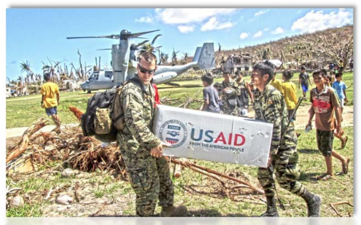
A U.S. Marine and a Philippine Army soldier distribute U.S. Agency for International Development relief supplies from an MV-22 Osprey in Luzon, Philippines, following Typhoon Haiyan.

amphibious ships homeported in the Pacific, and the deployment of surface vessels such as Joint High Speed Vessels to the region. The Department is increasing the number of U.S. naval and air forces and relocating Marines to Guam as part of our distributed laydown, which will result in a force posture that is more geographically