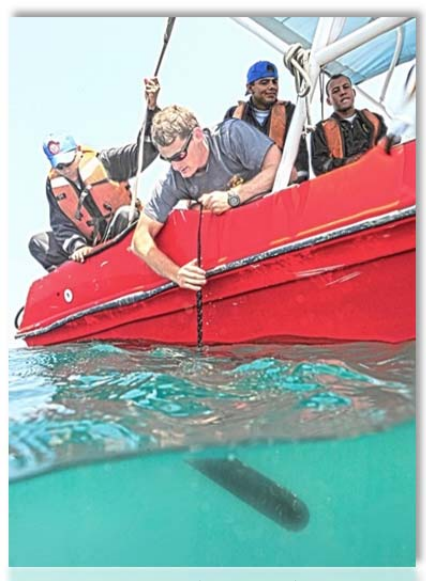
A U.S. Navy Diver lowers a side-scan sonar with the help of Colombian divers during Navy Dive-Southern Partnership Station 2012, off the coast of Colombia.