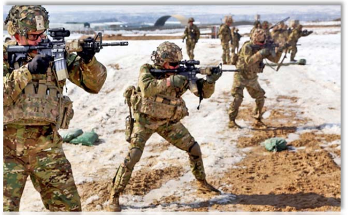
Soldiers of the U.S. Army 10th Mountain Division's Headquarters Company, 3rd Brigade Combat Team conduct live-fire range training with M4 carbines in Afghanistan's Paktiya province.

Maintaining power projection capabilities that can counter not only state threats but also non-state threats is also increasingly critical. The United States will maintain a worldwide approach to countering violent extremists and terrorist threats using a combination of economic, diplomatic, intelligence, law enforcement, development, and military tools. The Department of Defense will rebalance