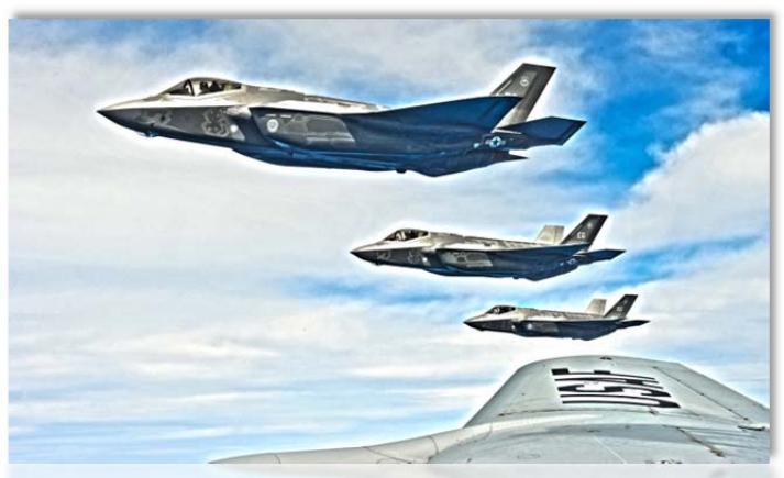
F-35A Lightning IIs perform an aerial refueling mission with a KC-135 Stratotanker, off the coast of Florida. The 33rd Fighter Wing at Eglin Air Force Base trains Air Force, Marine, Navy, and international partner operators and maintainers of the F-35 Lightning II.

We will retain and strengthen our power projection capabilities so that we can deter conflict, and if deterrence fails, win decisively against aggressors. The North Korean regime continues to pursue interests counter to those of the United States. Faced with this threat, the United States is committed to maintaining peace and security on the Korean Peninsula and closely monitors the situation through military and diplomatic channels in