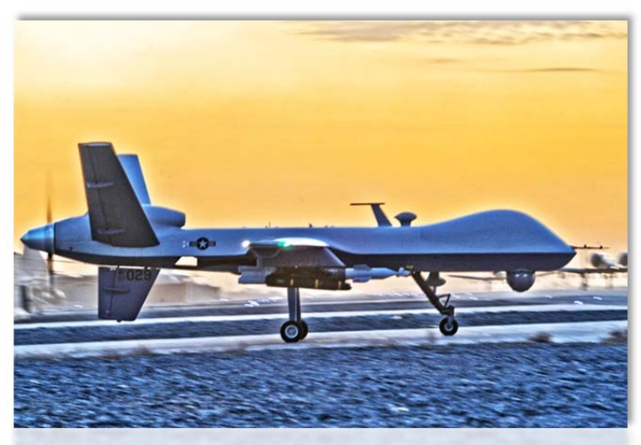
A U.S. Air Force MQ-9 Reaper unmanned aerial vehicle taxis at Kandahar Airfield, Afghanistan.

between states, nonstate entities, and private citizens. fundamentally globalized world, economic growth in Asia; aging populations in the United States, Europe, China, and continued Japan; instability in the Middle East and and many Africa: