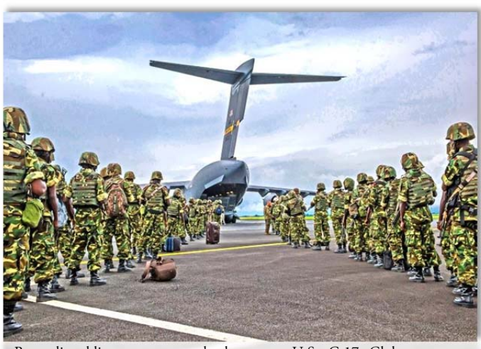
Burundi soldiers prepare to load onto a U.S. C-17 Globemaster at Bujmumbura Airport, Burundi. In coordination with the French military and the African Union, the U.S. military provided airlift support to transport Burundi soldiers, food, and supplies in the Central African Republic.

U.S. engagement in the Western Hemisphere is aimed at promoting and maintaining regional stability. Department will focus its limited resources on countries that want to partner with the United States and demonstrate a commitment to investing the time and resources required to develop and sustain an effective, We will civilian-led enterprise. emphasize building defense institutional capacity, increasing interoperability with the United States and other likeminded partners, and supporting a