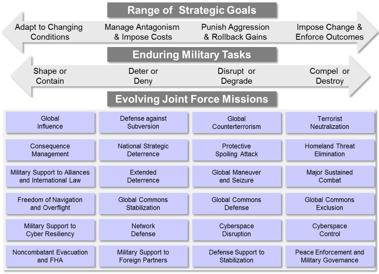
Figure 10. Evolving Joint Force Missions

To secure the broadest interests of our Nation, political leaders will demand real options from their military. In turn, military leaders require clear strategic guidance and assurance that political leaders understand what military power can feasibly achieve and the consequences of using military power. This range of missions is a start point for that future dialogue – a dialogue whose outcome is shaped by the force development activities of today (see Figure 10).