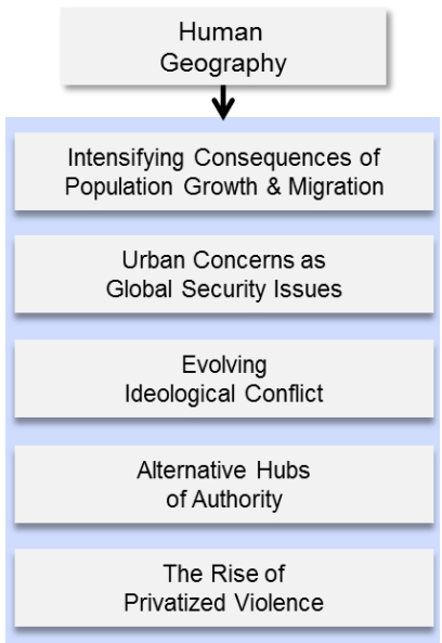
Figure 3. Conditions in Human Geography

The Joint Force will face a future socio-cultural world largely defined by the conditions depicted in Figure 3. The future security environment will feature large areas of the globe where states struggle to maintain a monopoly on violence and individual identities are no longer based exclusively on a sense of physical location. Individuals and groups will connect and socialize globally. Widespread economic growth will raise millions out of poverty into longer and more comfortable lives. However, a richer human world lacking legally constituted and legitimate governance may lead to dissatisfaction, violence, and even the emergence of violent transnational ideologies that disrupt local, state, or regional governments. Growing wealth can also stress food, water, energy, and other resources, causing higher prices and shortages which may translate into instability, civil conflict, and the failure of governments. Fractured and failed governments may transmit disorder more broadly or become geopolitical opportunities for more well-ordered and aggressive states.