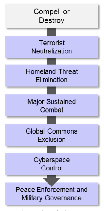
Figure 9. Missions to Compel or Destroy

The Joint Force must be prepared to fully defeat adversaries directly threatening the United States or the global system of allies, rules, and norms that it supports by ensuring that they are no longer willing or able to present a threat to U.S. interests. Consequently, the Joint Force will