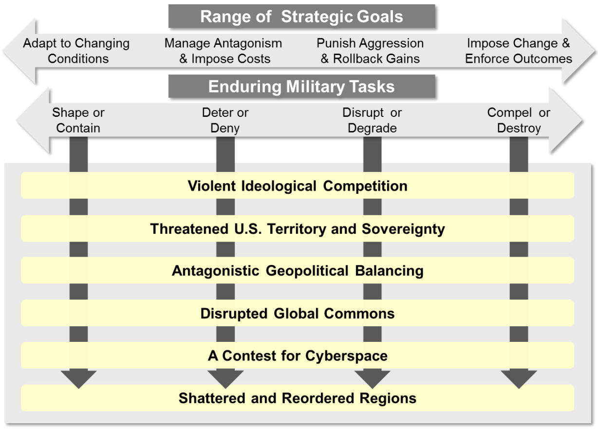
Figure 5. Enduring Strategic Goals, Military Tasks, and Contexts of Future Conflict

evolving Joint Force missions found in the remainder of Section 3 is specifically derived by examining the intersection of strategic goals and their associated military tasks with the Contexts of Future Conflict (see Figure 5).