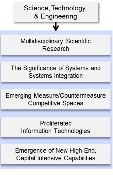
Figure 4. Conditions in Science, Technology & Engineering

The Joint Force will face a future technological landscape largely defined by the conditions depicted in Figure 4. The U.S. approach to high-technology warfare over the past two decades encouraged development has the of asymmetric. unconventional, irregular, and hybrid approaches by adversaries. Adversaries will continue to innovate by applying varying mixes of high and low technologies to frustrate U.S. interests and military forces. By 2035, the United States will confront a range of competitors seeking to achieve technological parity in a number of key areas. Adversary forces will be augmented by advanced C3/ISR and information technologies, lethal precision strike and area effect weapons, and the capacity to field first-rate technological innovations. The cumulative result will be a situation in which, "Our forces face the very real possibility of arriving in a future combat theater and finding themselves facing an arsenal of advanced, disruptive technologies that could turn our previous technological advantage on its head – where our armed forces no longer have uncontested theater access or unfettered operational freedom of maneuver."9