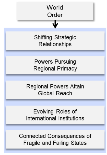
Figure 2. Conditions in World Order

The Joint Force will face a future world order largely defined by the conditions listed in Figure 2. Over the next two decades, many of the rules and norms governing the international system will come increasingly under pressure. In a world with no overarching global authority, rules are only as strong as the willingness of states to follow or enforce them. Some rising powers will be dissatisfied with the ability of international institutions to accommodate their growing power and influence. Furthermore, they will strive for the political will, economic capacity, and military capabilities to compel change at the expense of the United States, its allies, partners, and global interests. Other declining, though still powerful, states will seek to insulate themselves from international norms and rules in order to create the political space necessary to threaten and coerce neighbors.