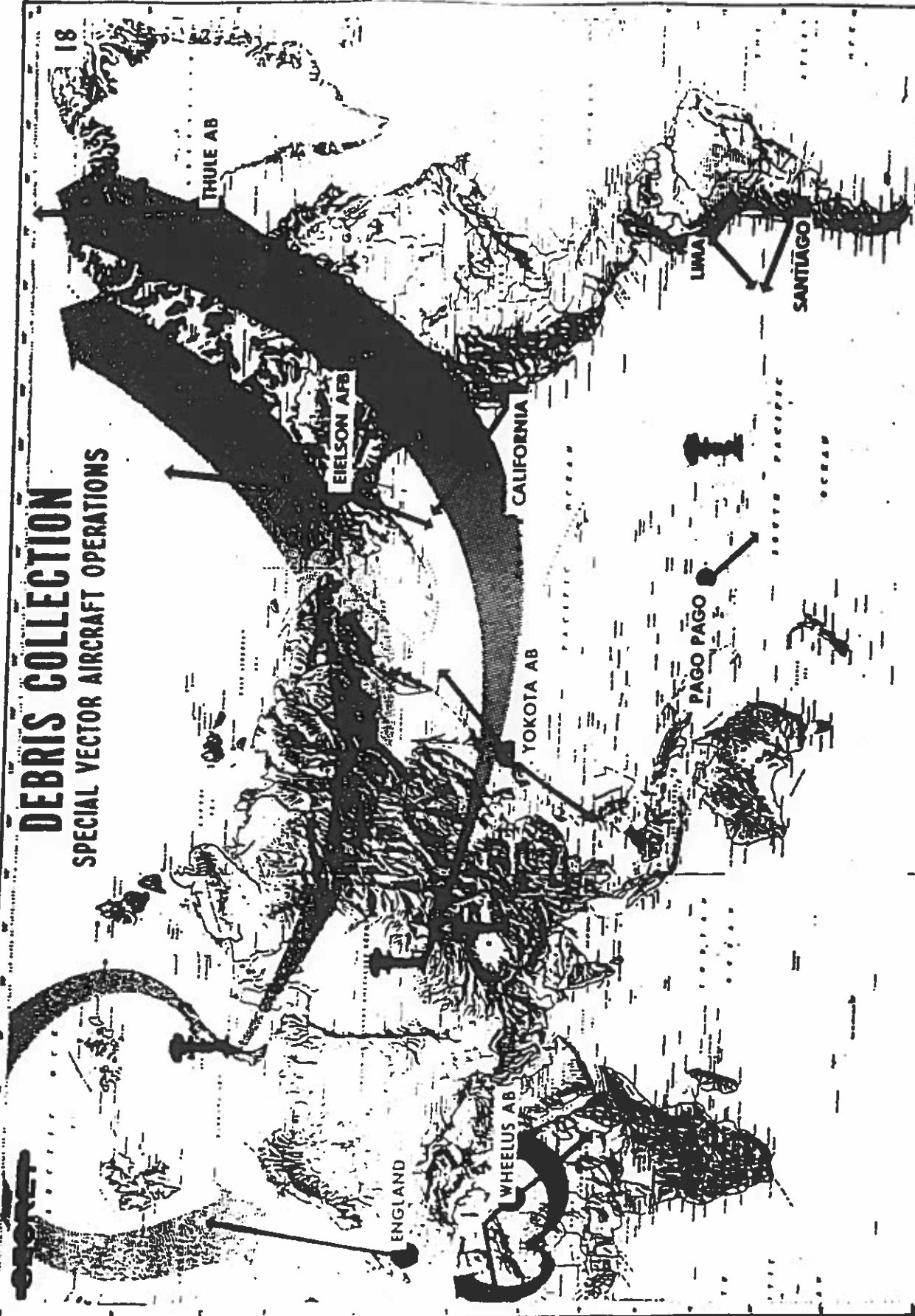
TYPICAL DEBRIS PATTERNS AND DEPLOYMENTS