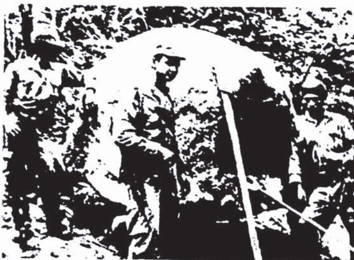
Oven found at original guerrilla campsite at Nacahuasu.