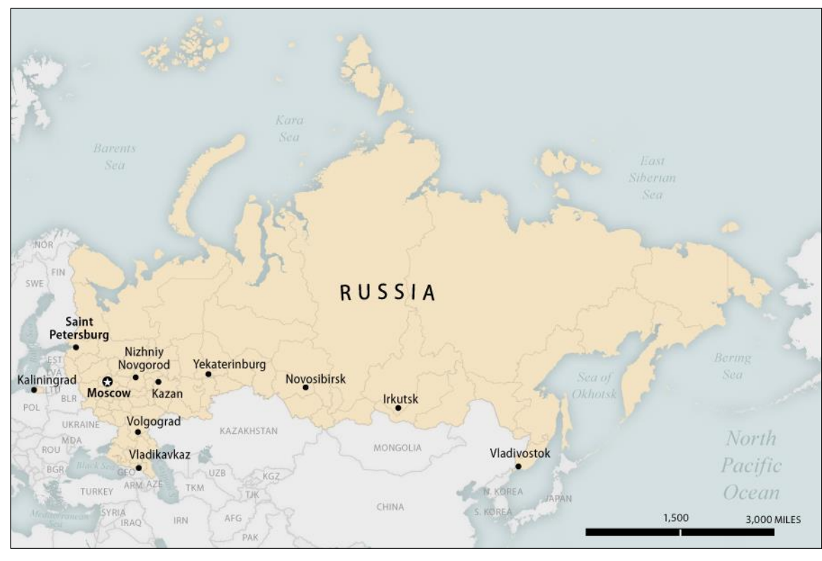
Figure 1. Map of Russia

appellate body. The Constitutional Court rules on the legality and constitutionality of governmental acts and on disputes between branches of government or federative entities. A 2015 law gives the Constitutional Court the legal authority to disregard verdicts by interstate bodies that defend human rights and freedoms, if the court concludes that such verdicts contradict Russia's constitution (although the latter requires compliance of rules established by international treaties over domestic law). A Supreme Commercial Court, which handled commercial disputes and was viewed by experts as relatively impartial, was dissolved in September 2014, with its areas of jurisdiction transferred to the Supreme Court; lower-level commercial courts continue to function.