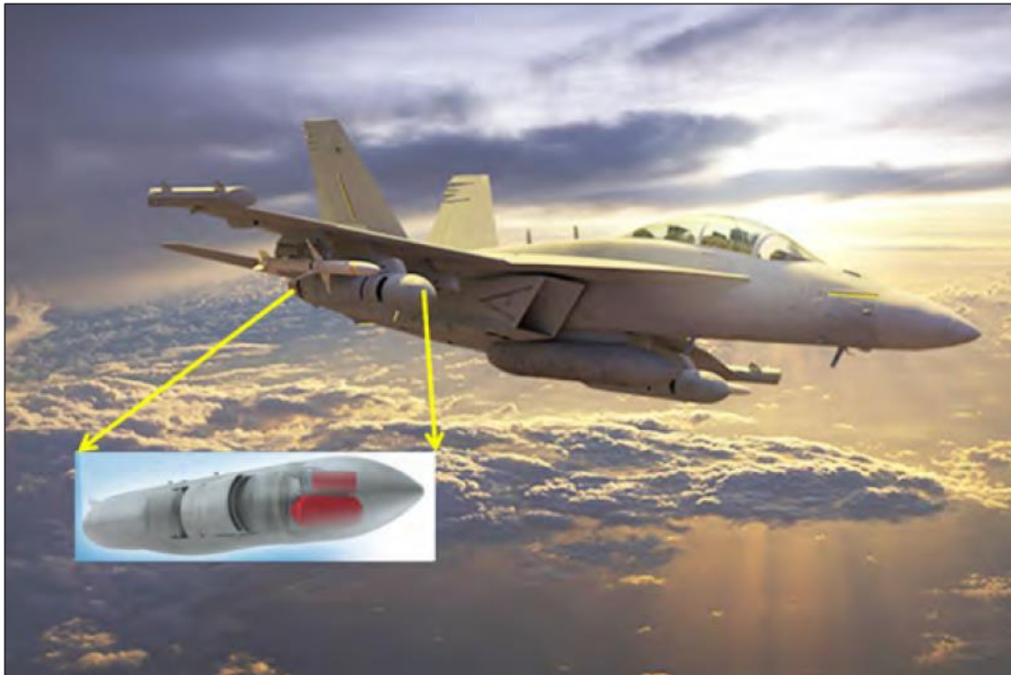
Figure 10. Next Generation Jammer—Mid Band (NGJ-MB) (Artist's rendering)

Source: Department of Defense, Director, Operational Test & Evaluation, FY 2016 Annual Report , December 2016, p. 303.