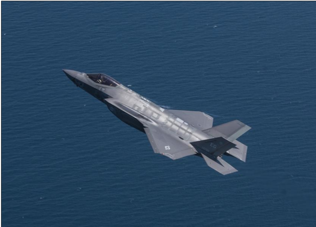
Figure 5. F-35 Joint Strike Fighter