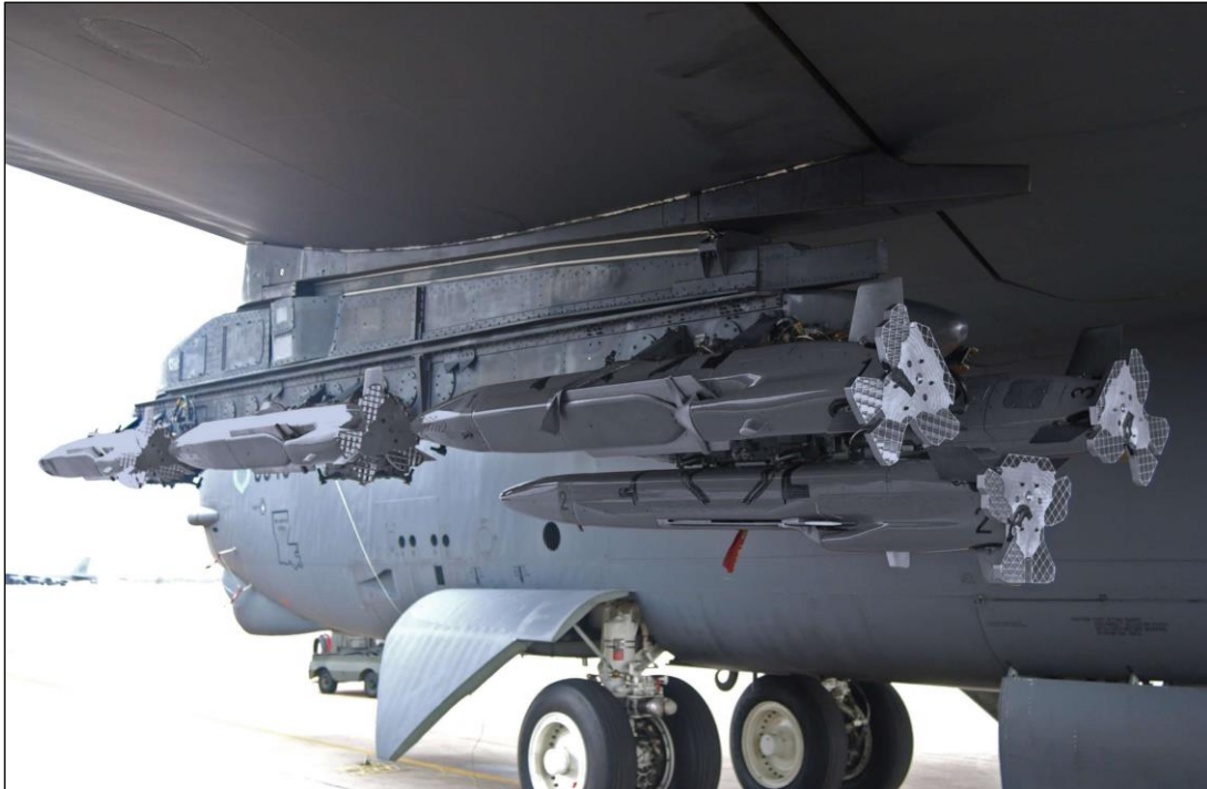
Figure 12. Miniature Air-Launched Decoy (MALD) (Shown fitted to a B-52H bomber)

Source: Photo accompanying Tyler Rogoway, "Recent MALD-X Advanced Air Launched Decoy Test Is A Much Bigger Deal Than It Sounds Like," The Drive , August 24, 2018. The caption to the photo states: "MALDs loaded up on a B-52H."