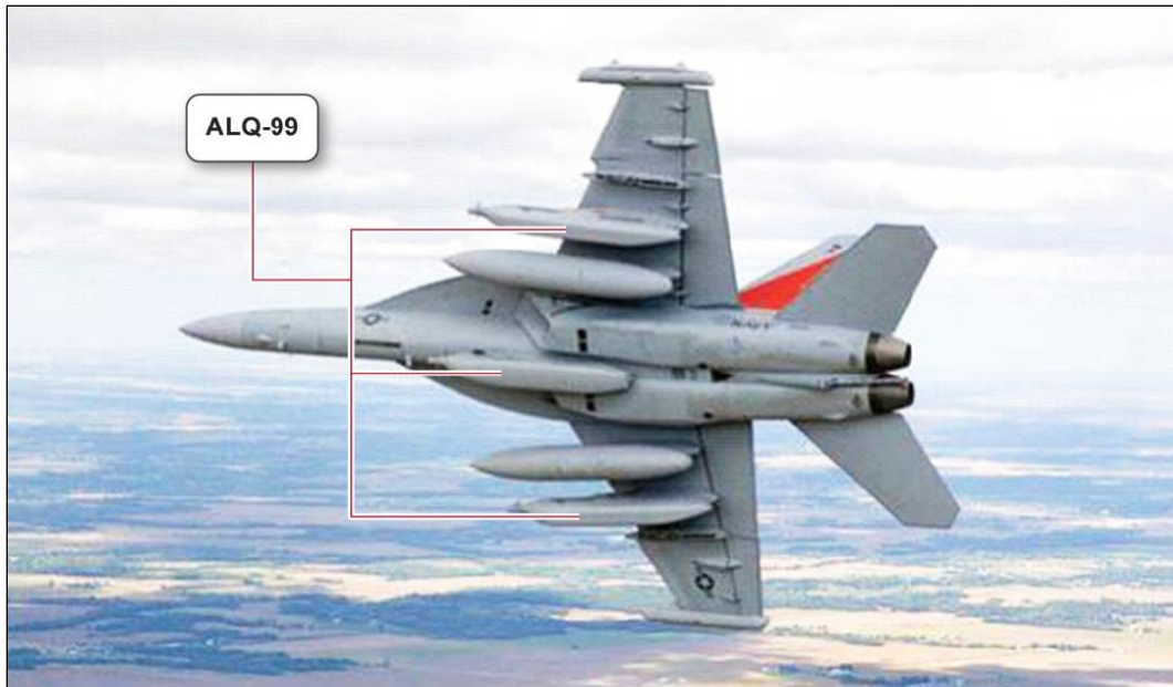
Figure 7. EA-18G Growler Equipped with AN/ALQ-99F Tactical Jamming System