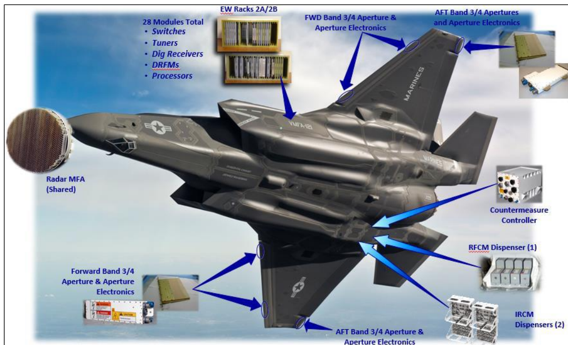
Figure 6. F-35 EW System-Related Equipment