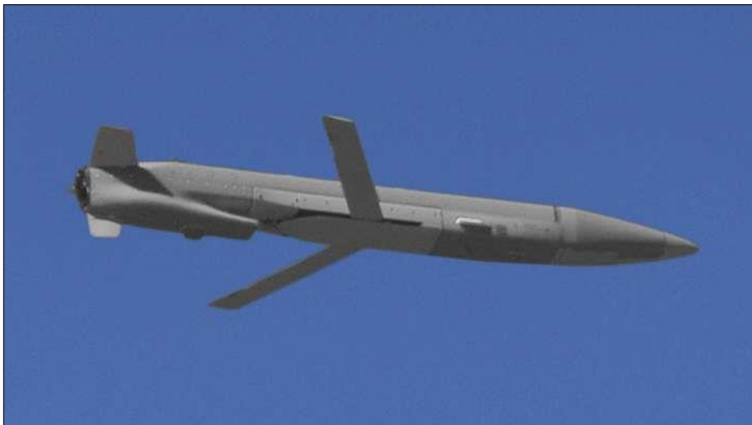
Figure 13. Miniature Air-Launched Decoy (MALD)