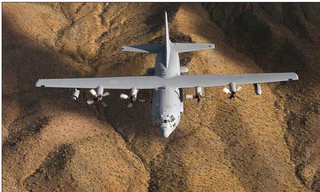
Figure 3. EC-130H Compass Call