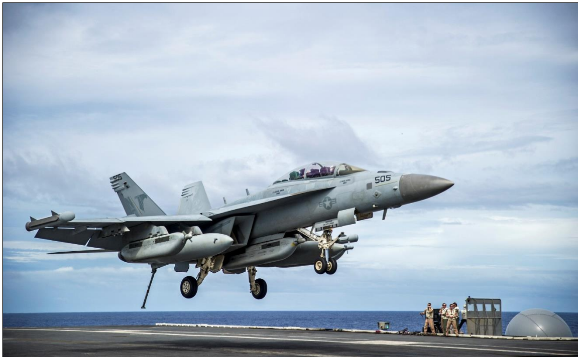
Figure 2. EA-18G Growler