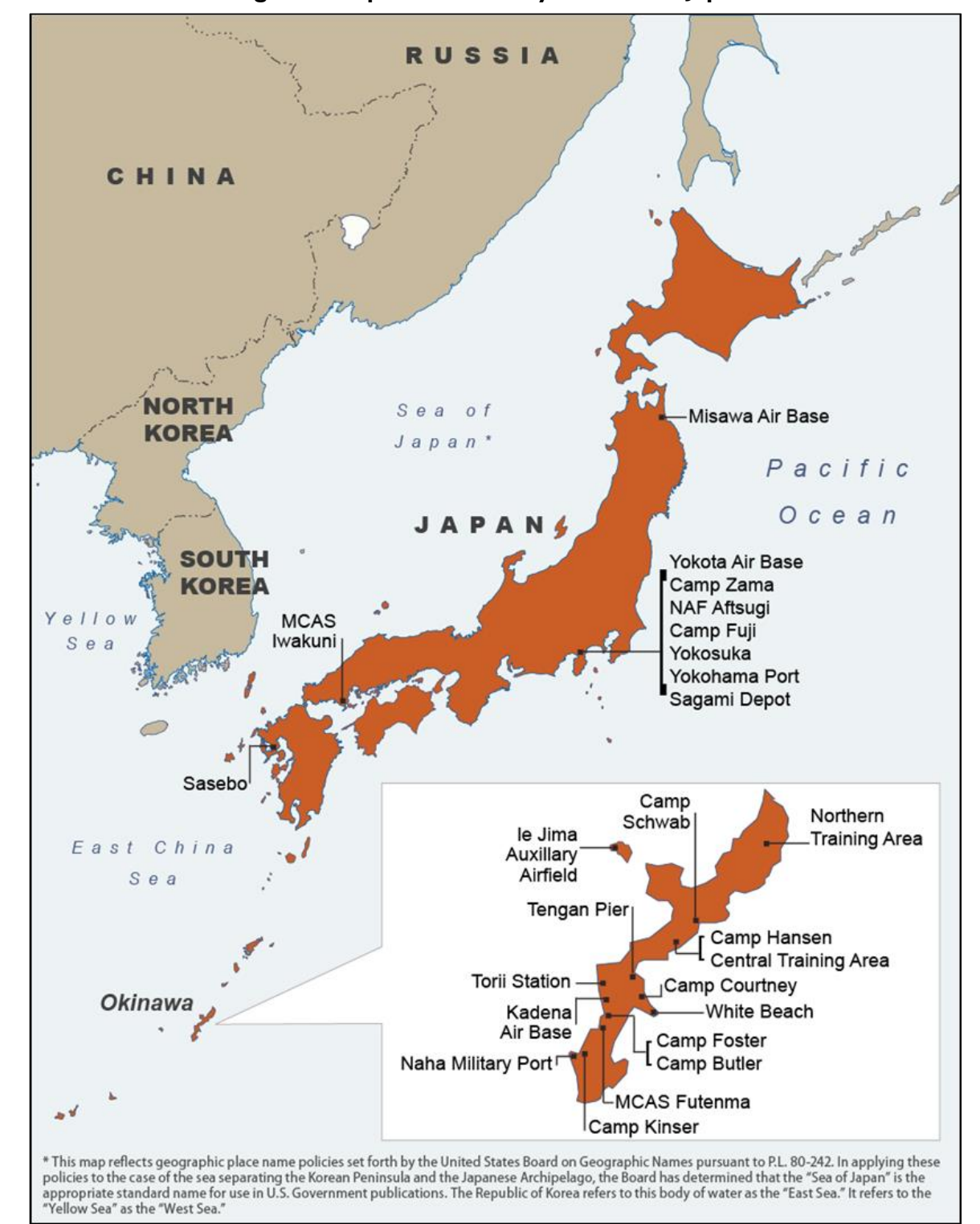
Figure 4. Map of U.S. Military Facilities in Japan