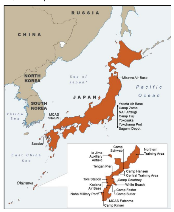
The U.S. Military in Japan: 54,000 troops with the exclusive use of 85 facilities

Since the early 2000s, the United States and Japan have improved the operational capability of the alliance as a combined force, despite constraints. In addition to serving as a hub for forward-deployed U.S. forces, Japan now fields its own advanced military assets, many of which complement U.S. forces in missions like antisubmarine operations. The joint response to a 2011 tsunami and earthquake in Japan demonstrated the increased interoperability of the two militaries. Cooperation on ballistic missile defense and new attention to the cyber and space domains remains ongoing.