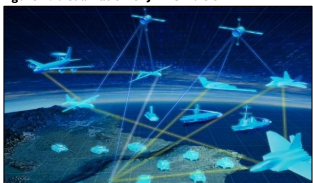
Figure 1. Visualization of JADC2 Vision