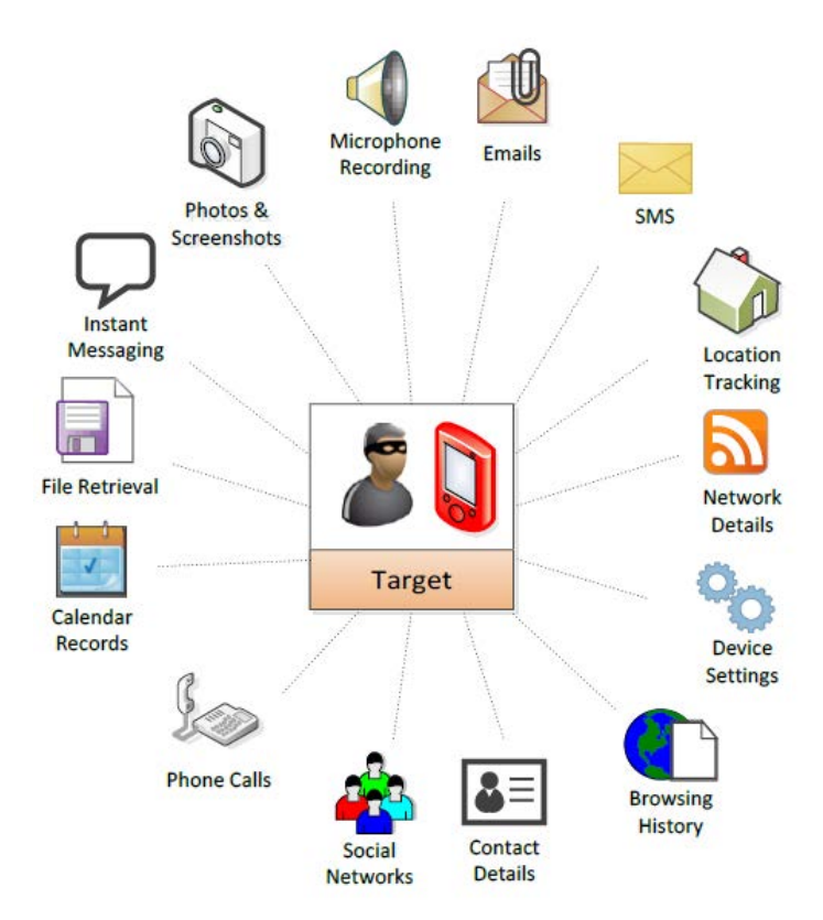
Figure 2: Diagram from purported NSO Group Pegasus documentation showing the range of information gathered from a device infected with Pegasus.

Israel-based "Cyber Warfare" vendor NSO Group produces and sells a mobile phone spyware suite called Pegasus . To monitor a target, a government operator of Pegasus must convince the target to click on a specially crafted exploit link , which, when clicked, delivers a chain of zero-day exploits to penetrate security features on the phone and installs Pegasus without the user's knowledge or permission. Once the phone is exploited and Pegasus is installed, it begins contacting the operator's command and control (C&C) servers to receive and execute operators' commands, and send back the target's private data, including passwords, contact lists, calendar events, text messages, and live voice calls from popular mobile messaging apps. The operator can even turn on the phone's camera and microphone to capture activity in the phone's vicinity.