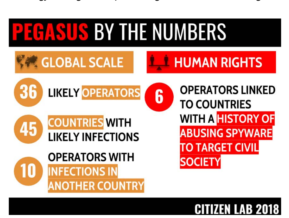
Figure 1: Scope, scale, and context of Pegasus as identified in this report.