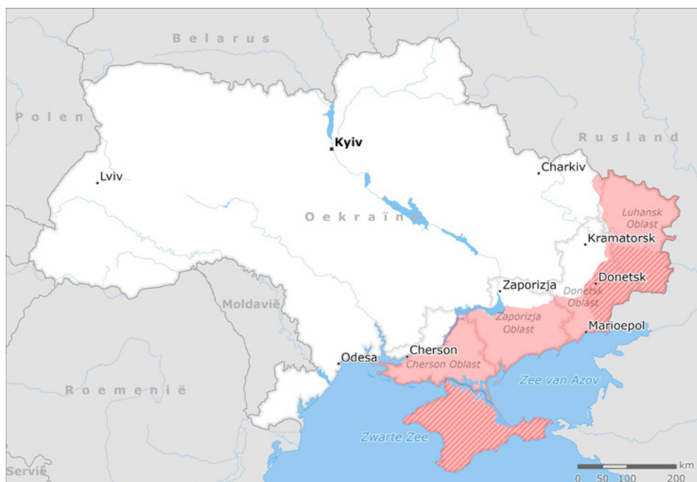
Figure 1. Oblasts illegally annexed by Russian Federation and front line as of mid-February 2023

In the run-up to the invasion Moscow accused Ukraine, the US and other Western countries of preparing provocations using chemical substances and of maintaining a covert biological weapons programme. It has continued to voice these accusations ever since, using the media, diplomatic channels and international organisations to reinforce this message. Ukraine has also been accused on occasions of seeking to obtain nuclear weapons or mount an attack using a dirty bomb, although such accusations are not substantiated by facts.