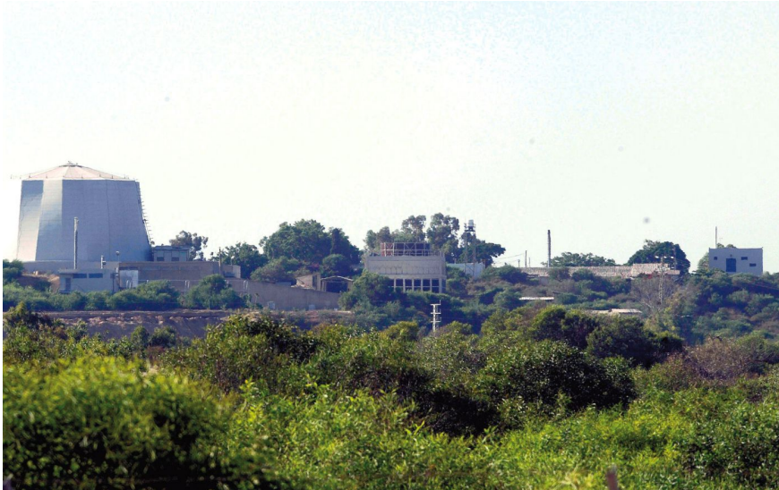
The reactor at Nahal Sorek. After two visiting Atomic Energy Commission scientists had inspected this small, U.S.-supplied facility, they were unexpectedly offered a sightseeing tour – that ended with a stop at Dimona.

By early February, American officials were characterizing the second visit to Dimona as a “fiasco” and urged fresh thinking within the AEC, State Department, and probably the White House about how the United States could effectively and systematically monitor the reactor. One conclusion was that an effective inspection regime would demand biannual visits. The reason for the proposed frequency was purely technical: To trace extraction of weapons-grade plutonium, there must be two visits annually, because production reactors operate on a much shorter schedule than research reactors.