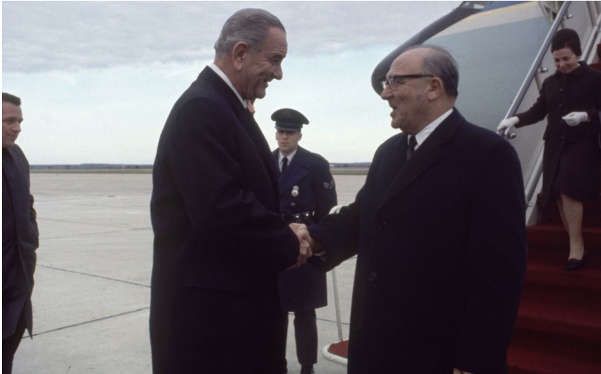
President Johnson greets Levi Eshkol, 1968. The president never pressed the Israeli leader hard for biannual U.S. visits to Dimona, the way Kennedy did with Ben-Gurion.