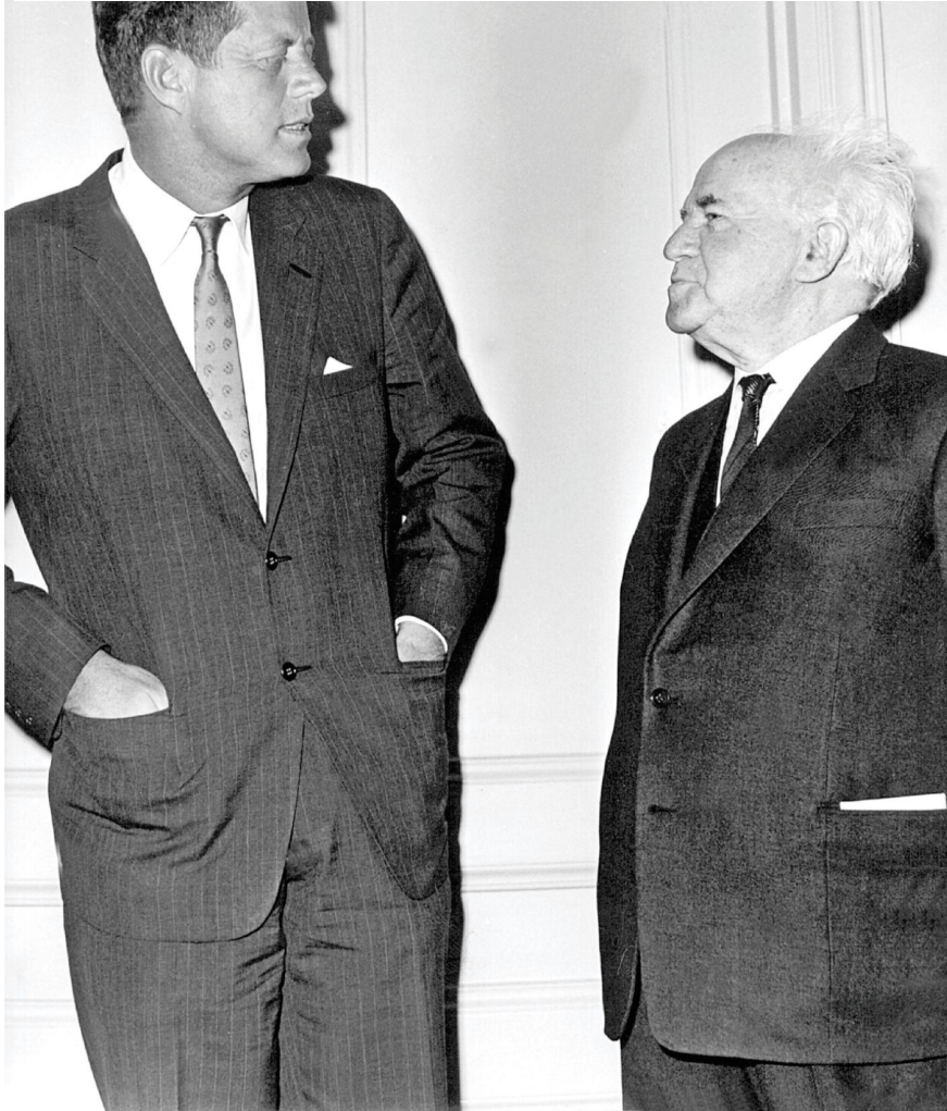
Kennedy and Ben-Gurion. Their meeting in May 1961 helped to clear the air but did not remove lingering American doubts and suspicions about Israel's nuclear intentions.