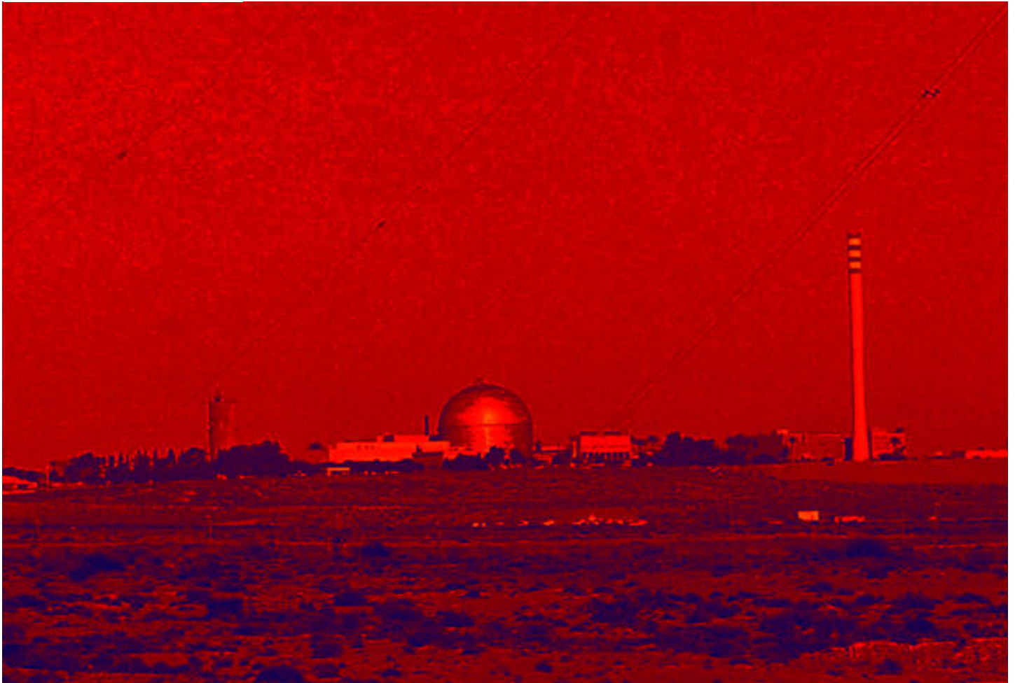
The Dimona reactor.